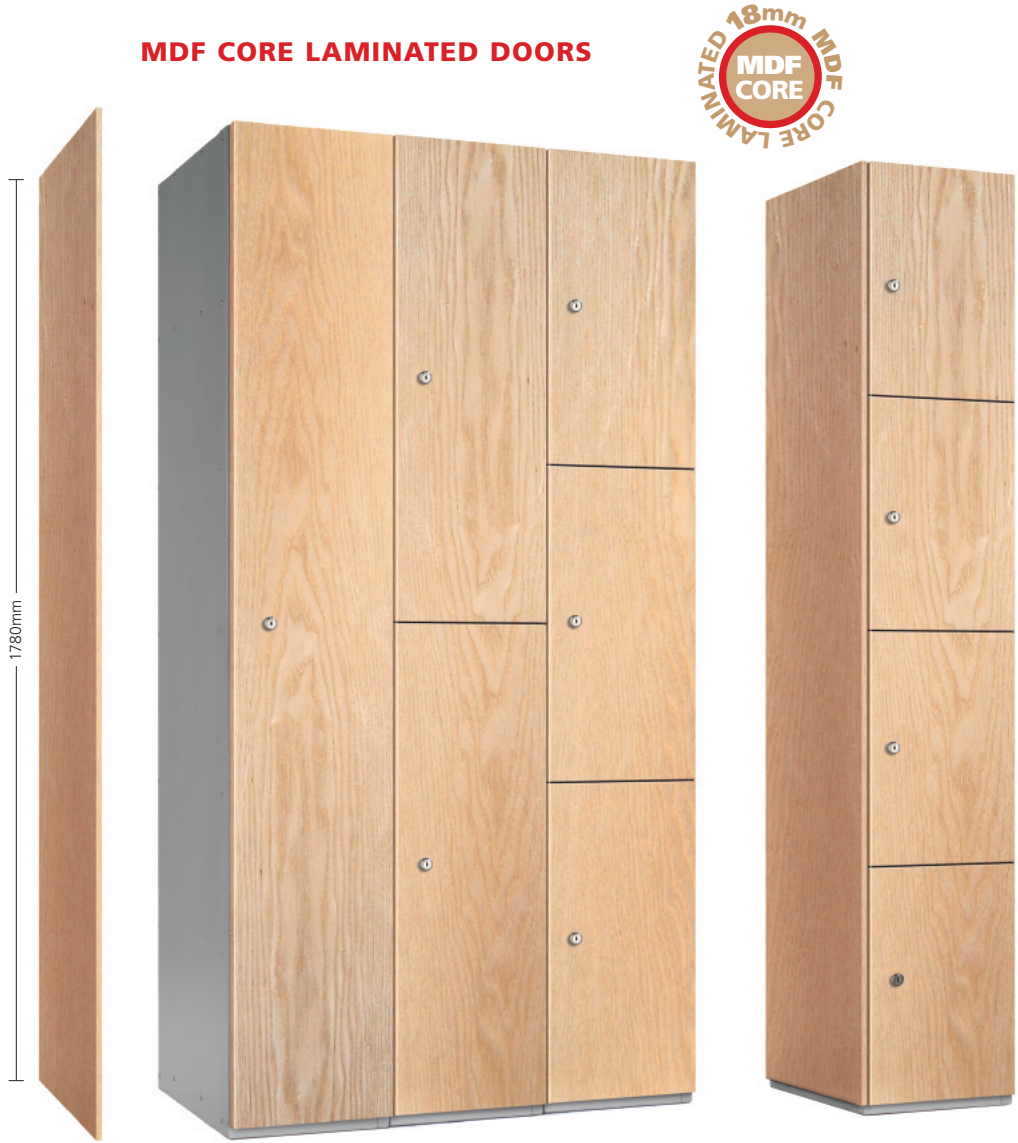
MDF CORE LAMINATED DOORS

Probe offer five durable timber effect finishes plus two single colours, to a standard steel body, in 1,2,3 & 4 compartment Lockers.