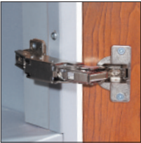
EASY ACCESS HINGES Hinges open through a wide 164° for ease of access.